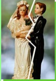
Matrimony to Acrimony

(Though they vowed that no girl would ever come between them, Biff and Trevor could not keep acrimony from overwhelming their friendship after they both fell in love with the lovely Teresa.)